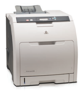
HP Color LaserJet 3600n Q5987AA—5,000 points